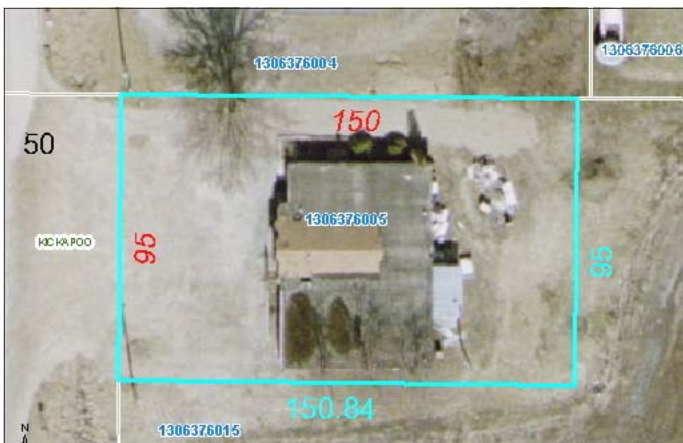
Satellite photo showing boundaries